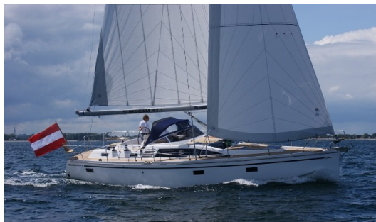
The SUNBEAM 34: European Yacht of the Year, 2008

In January 2008, Schöchli Yachtbau GmbH won the "European Yacht of the Year" award with its SUNBEAM 34. Together with its Sydney-based representative, Westhead Marine, the company introduced the yacht to the Australian sailing fraternity at that year's Sydney International Boat Show, where the new brand was instantly embraced.