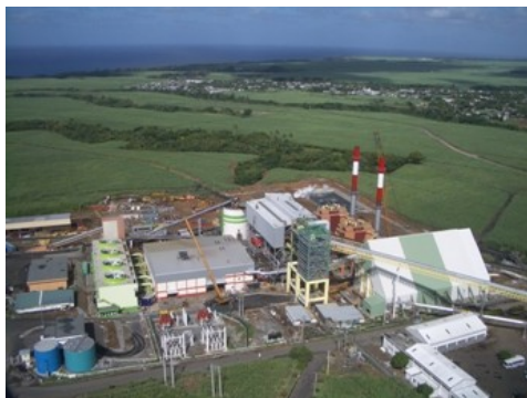
A bagasse cogeneration plant by built by AE&E in Mauritius, similar to the one ordered for Mackay, QLD

The state-of-the-art cogeneration plant will produce renewable energy and steam from the combustion of bagasse – a waste product of sugarcane crushing. Additional bagasse will be supplied from other mills in the group, to extend the period of operation beyond the crushing season, and any fuel shortfall will be made up with coal. Surplus steam will be used to generate electricity for sale via Australia's renewable energy trading scheme, through a national energy retailer. The project will replace an outdated bagasse and coal fired boiler with a highly efficient new unit.