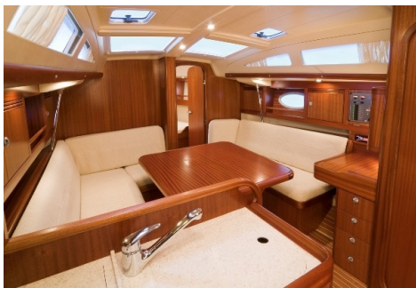
The elegant saloon of the SUNBEAM 34