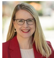
Ms. Margarete Schramböck Austrian Federal Minister for Digital and Economic Affairs www.bmdw.gv.at

Margarete Schramböck was born 1970 in Tyrol, Austria. She studied Business Administration at the University of Economics and Business in Vienna (WU), where she obtained her Doctorate in Social and Economic Sciences in 1997. Before Ms Schramböck started her career in 2002 as CEO of NextiraOne, an IT communications company based in Paris, she was occupying a management position at Alcatel. From December 2008 to December 2011 she became Managing Director of NextiraOne Germany. In 2014 Ms Schramböck began working as CEO of Dimension Data Austria, which is a globally leading provider of network and communications technologies and IT services, in particular in the fields of network and computer centres, cloud services, IT security, voice and