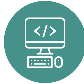
Electro / Electronics 11.6%