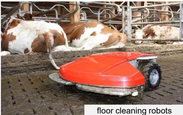
floor cleaning robots