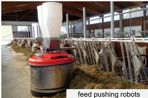
feed pushing robots