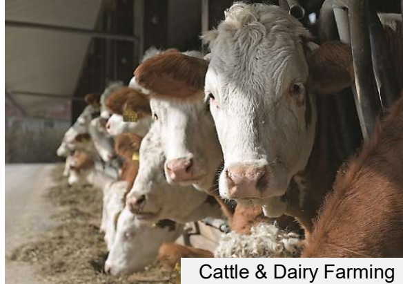
Cattle & Dairy Farming