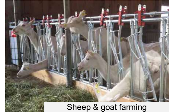
Sheep & goat farming