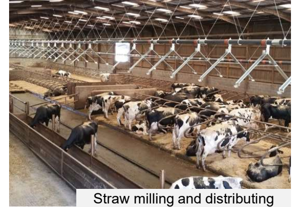
Straw milling and distributing