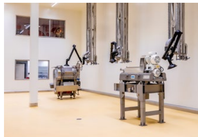
Dewatering, filtration and drying equipment can be tailored to your needs

Whatever option you choose, you can rest assured that we will use our expertise and in-depth knowledge to guide you towards a well-founded decision and the most appropriate choice of technology for your specific business requirement.