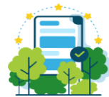
Digital regulation and environment