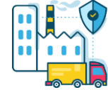
Digital jobs and business environment