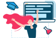
Digital competences and education