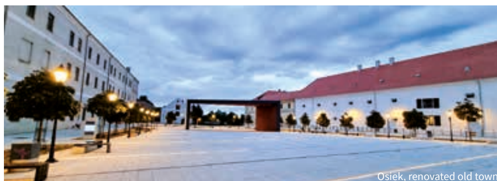
Osiek, renovated old town