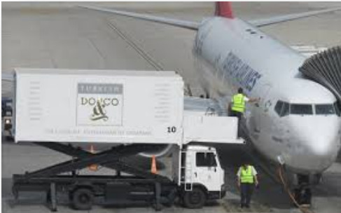
Turkish DO&CO Airline Catering

651 Mn. EUR currently invested, maximum in 2012 at 5,9 Bn.