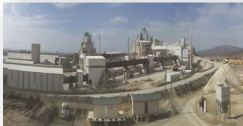
RHI Eskisehir Refractories, fireproof materials