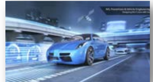
AVL World Class Engine Design