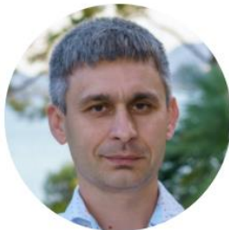
State Commissioner – Serhiy Tyschuk