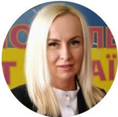
State Commissioner – Irina Kopaygora