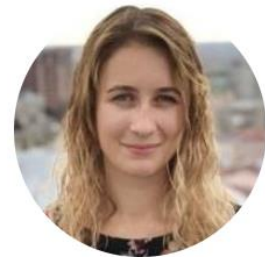
State Commissioner – Olga Nechitaylo