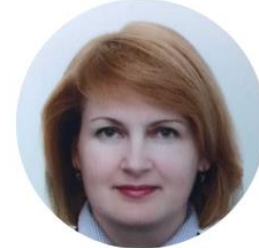
The First Deputy Chairman of the AMCU and state commissioner - Olga Muzichenko