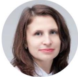
Deputy Chairman of the AMCU and State Commissioner - Natalia Buromenska