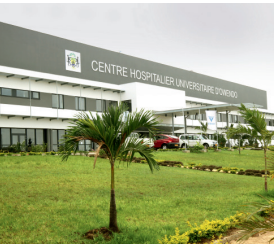
University Hospital Owendo Gabon