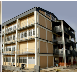
Teaching Hospital Tamale Ghana