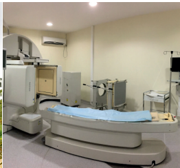
Gamma camera Owendo, Gabon