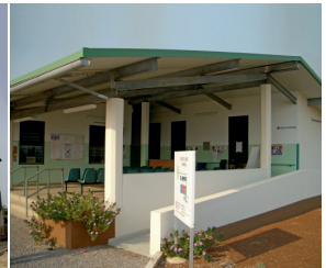
Polyclinic Janga Ghana

VAMED offers a complete project and service portfolio for health care as a developer, planner, contractor and operator. VAMED has already successfully implemented more than 850 hospitals, rehabilitation centers, nursing homes, health resorts and thermal spas in 80 countries worldwide.